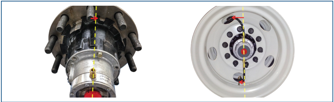
Figure 1: Best Hub and Wheel Clock - Hubcap fitting slightly clockwise from stud, inner tire valve stem counter clockwise from fitting, outer tire valve stem slightly clockwise from fitting.

Wheels with 5 hand holes require special clocking of the hub and wheels to ensure proper fit of hoses. There are three possible clock positions that can be used when mounting the hubcap to the hub. By lining up the hubcap hose fittings with the wheel studs, the hubcap can be properly clocked to the hub.