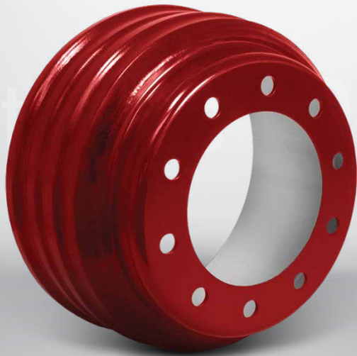
CentriFuse® HD Brake Drums