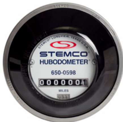
Current STEMCO Mechanical Hubodometer®

With this change, STEMCO mechanical Hubodometers continue to comply with prior requirements outside the United States (i.e., New Zealand).