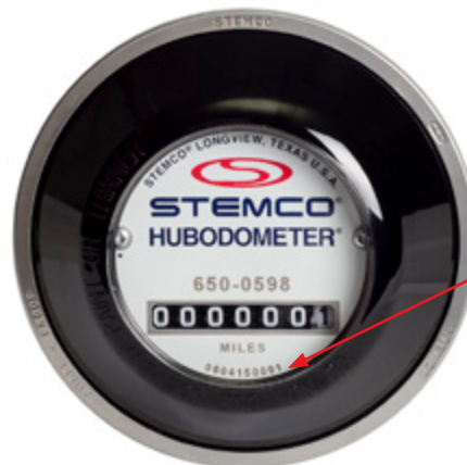
New STEMCO Mechanical Hubodometer® with Serial Number